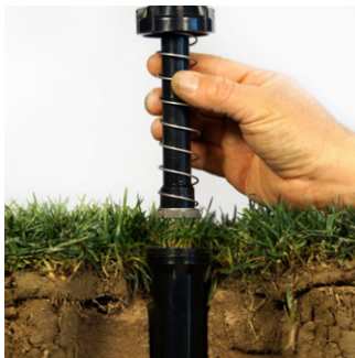
Remove existing sprinkler